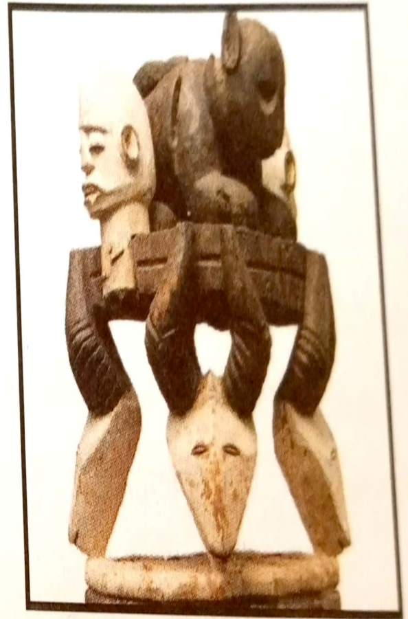
Some Igbo-Ukwu artworks