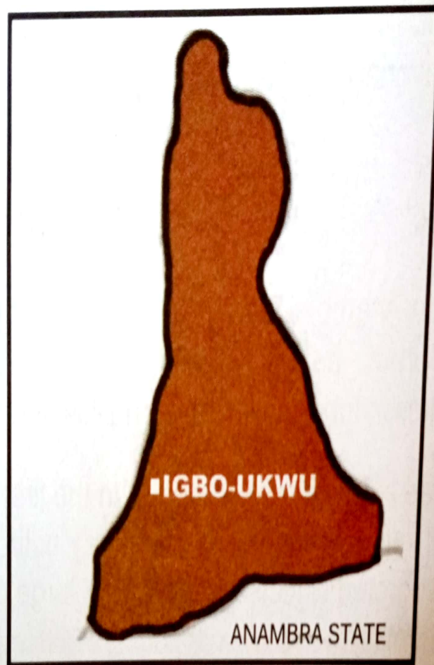
A map of Anambra State showing Igbo-Ukwu